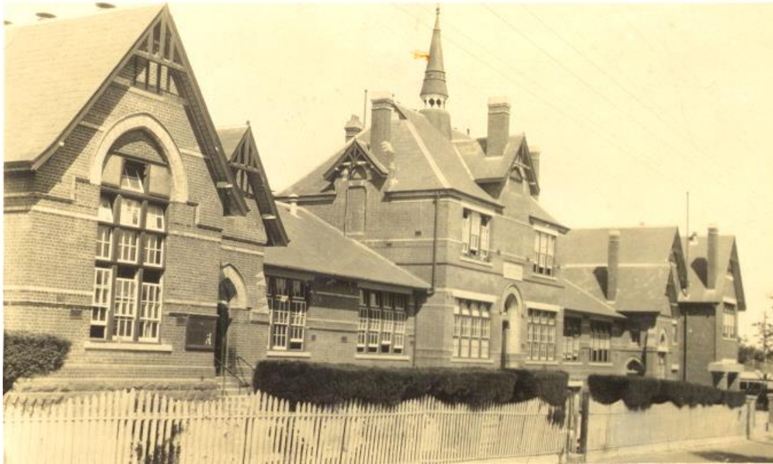
Built in 1878, Macarthur Street Primary School remains one of Ballarat's most significant buildings. This picture (circa 1930) depicts the slate roofing and symbolic belltower which were replaced in 1966.

Thank you for taking the time to read over this information. Please feel free to contact the school if there is anything you are unsure about or feel is not covered in this document.